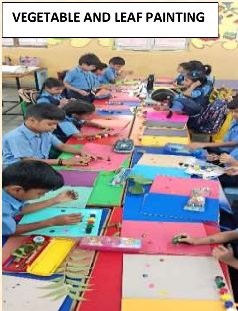
VEGETABLE AND LEAF PAINTING