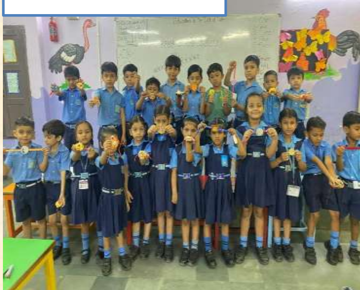
RAKHI MAKING ACTIVITY