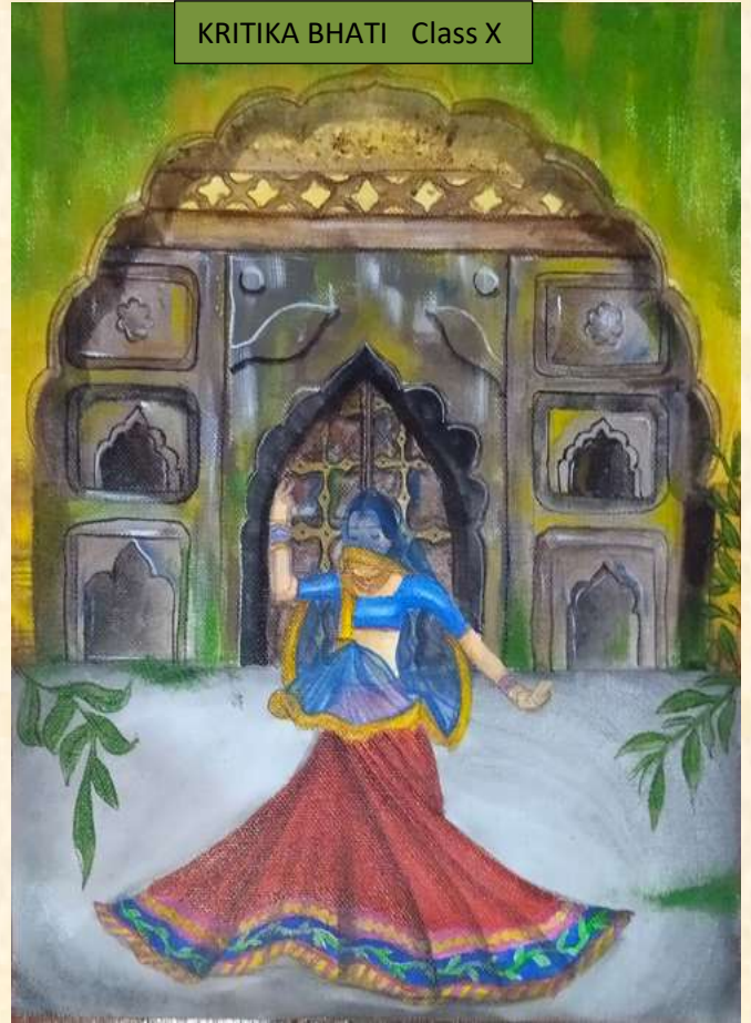
KRITIKA BHATI Class X