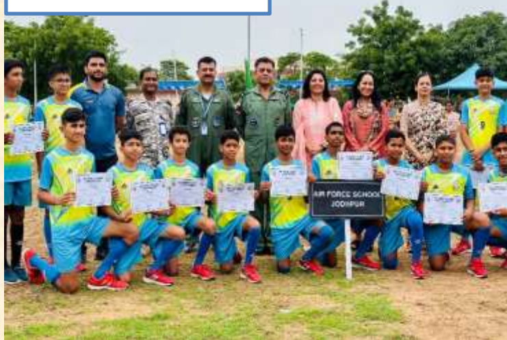
U-15 BOYS NATIONAL FOOTBALL TOURNAMENT