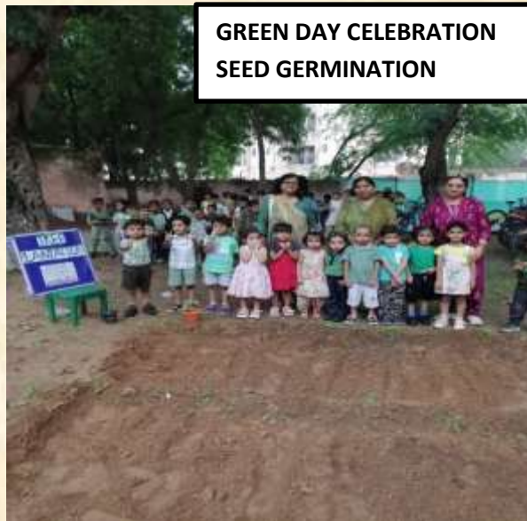
GREEN DAY CELEBRATION SEED GERMINATION