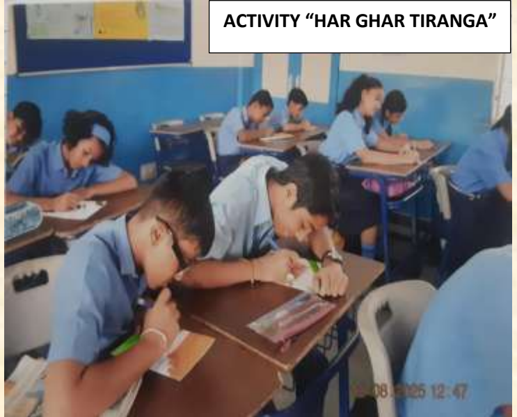
ACTIVITY "HAR GHAR TIRANGA"