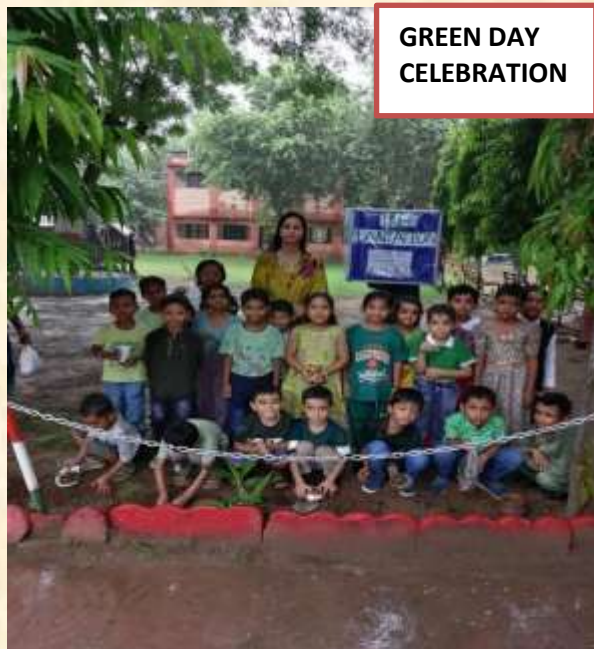
GREEN DAY CELEBRATION