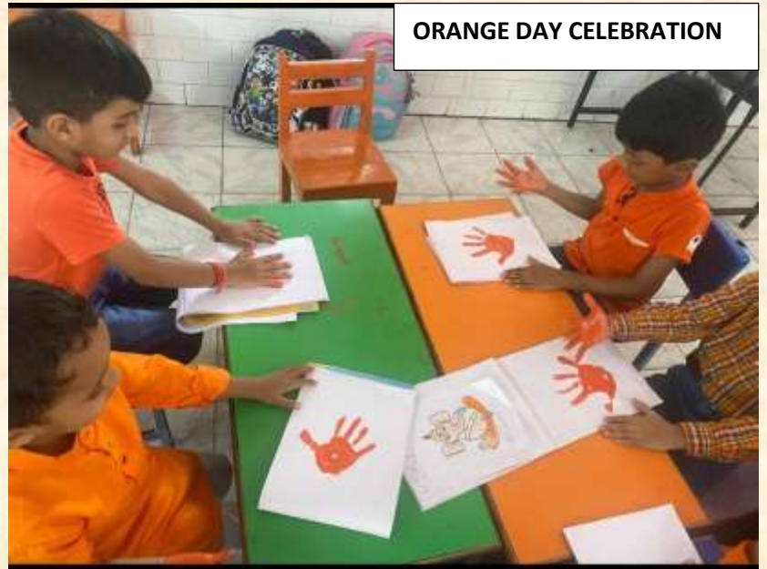
ORANGE DAY CELEBRATION