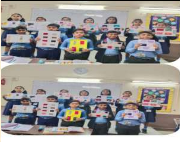
ACTIVITY - CATEGORIZE THE FABRICS INTO NATURAL AND MAN-MADE FABRICS.